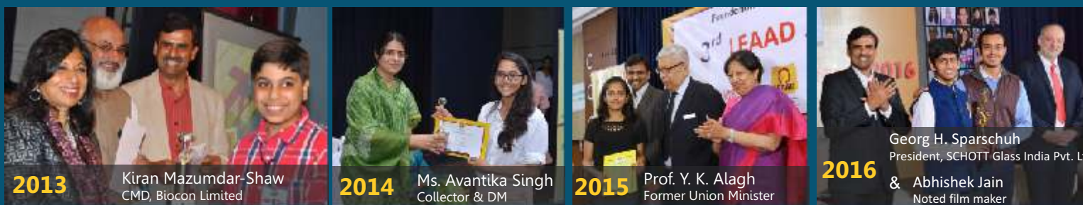
2013 Kiran Mazumdar-Shaw CMD, Biocon Limited