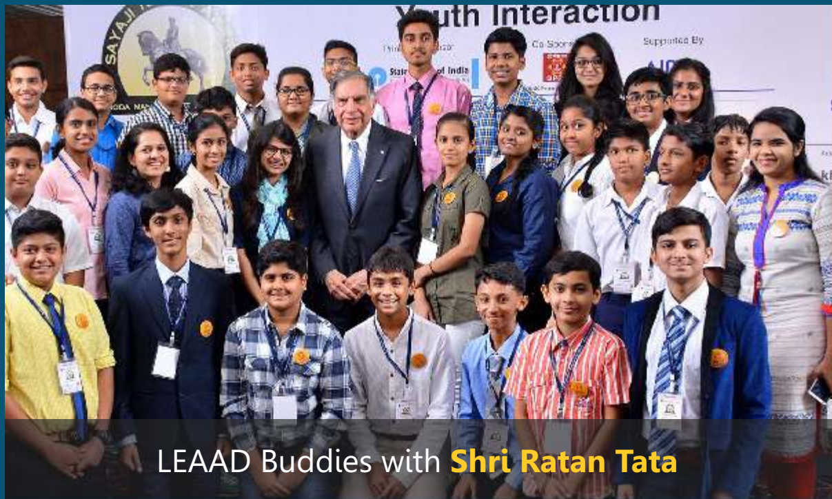
LEAAD Buddies with Shri Ratan Tata